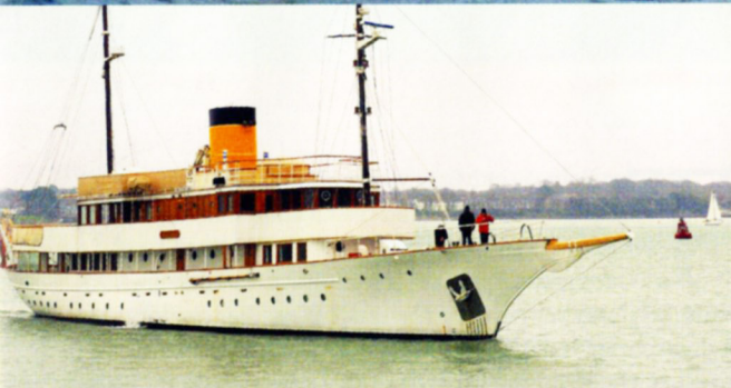
C/O SOLENT REFIT