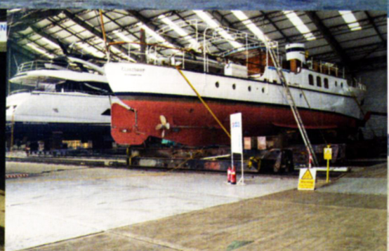
C/O SOLENT REFIT