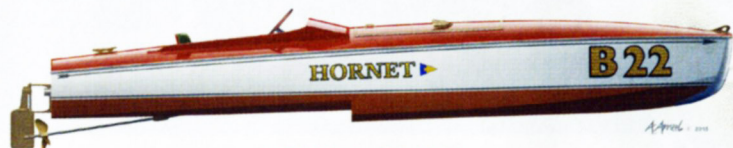
C/O BLOCK AND BECKET

The Great Lakes Boat Building School (est 2007), has nearly finished the build of a historically-accurate 32ft (9.8m) rowing gig for America's oldest sailing vessel - the 1795 USS Constitution ('Old Ironsides'). She's built on Cornish pilot gig lines taken off the 1838 gig Treffry which is still actively rowed by Newquay rowing club, and the school's Bud McIntire told us she'd be ready for a graduation day launch on 5 June. The school also built a 28ft (8.5m) whaler for the last sail-powered whaleship, the Charles W Morgan (CB318).